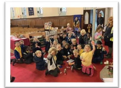
Year 1 walk around the local area