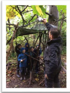
Year 4 building dens at forest school

As always, it's fantastic to see such enthusiasm and engagement from the children in their lessons, assemblies, wider opportunities, and overall life at our school. I do believe that the many varied and enriching experiences that are available for everyone at the school helps bring learning to life and gives children the chance to thrive and succeed in an element of school life. In addition, this supports children with developing the perseverance and concentration when being challenged in other aspects of their learning. This is one of the reasons why we hold our 'St. John's Learning Behaviours' in such high regard and weave these through everything we do at school.