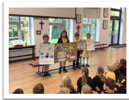
School Council Elections