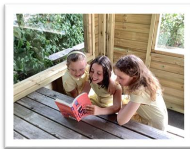
Shared Reading in the new outdoor shelter!