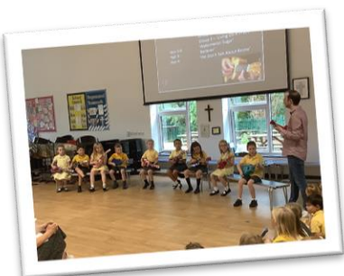
Ukuleles performing at Music Evening

As the academic year draws to a close we would like to take this opportunity to express our gratitude to everyone who has helped to make this such a successful year. Can we also wish all children, parents and families who are for various reasons leaving us the very best for the future.