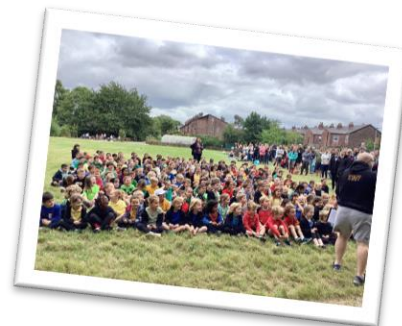
Sports Day during EFKF Week!