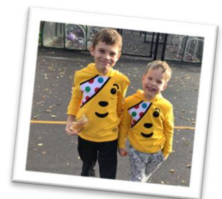
Raising money for Children in Need!