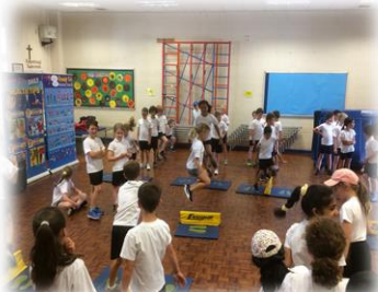
Freddie Fit In EFKF Week!