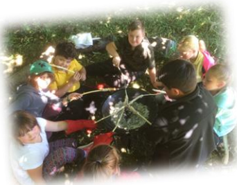
Marshmallows at Forest School

As the academic year draws to a close we would like to take this opportunity to express our gratitude to everyone who has helped to make this such a successful year. Can we also wish all children, parents and families who are for various reasons leaving us the very best for the future. Whilst we are all ready for a break we are already planning for the new academic year, which I am sure will be equally exciting and engaging as this year.