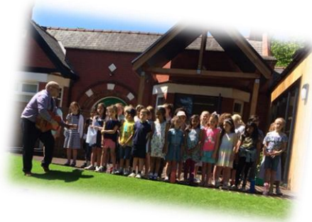
Choir sings at Freshfields Nursery