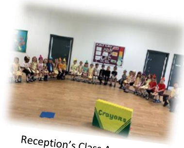
Reception's Class Assembly.