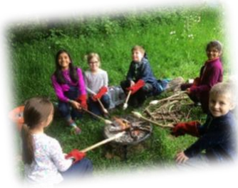
Making bread at Forest Schools.