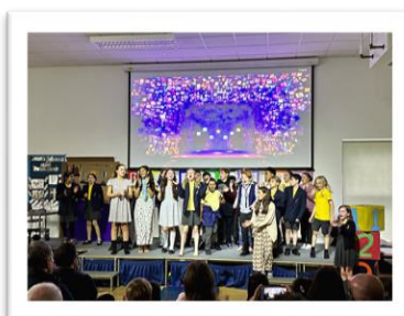
Year 6 Production: Matilda the Musical