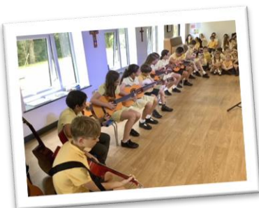
Music Evening 2023

As the academic year draws to a close we would like to take this opportunity to express our gratitude to everyone who has helped to make this such a successful year. Can we also wish all children, parents and families who are for various reasons leaving us the very best for the future.