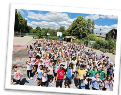
Colour Aerobics Party - EFKF Week!